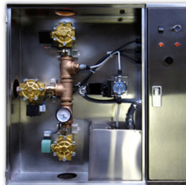
PCU CORE Control Panel

The CORE Protection Fire System is an automatic, pre-engineered fire suppression system. The CORE protection System is designed to provide primary coverage for Pollution control equipment including ducts and filters.