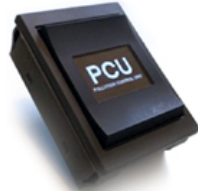
HMI - human machine interface