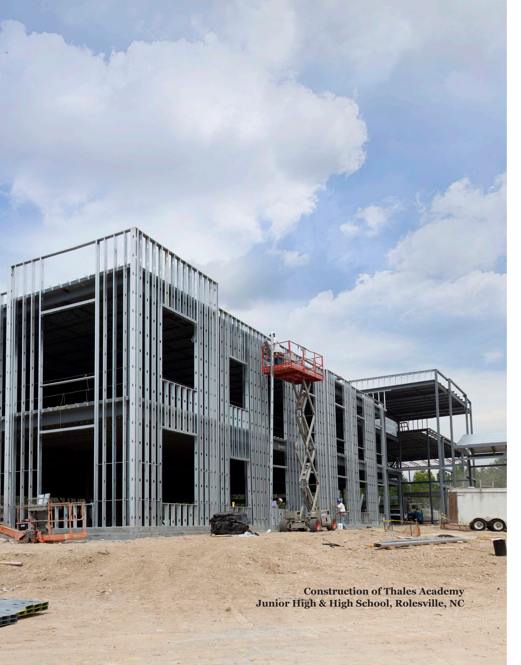
Construction of Thales Academy Junior High & High School, Rolesville, NC