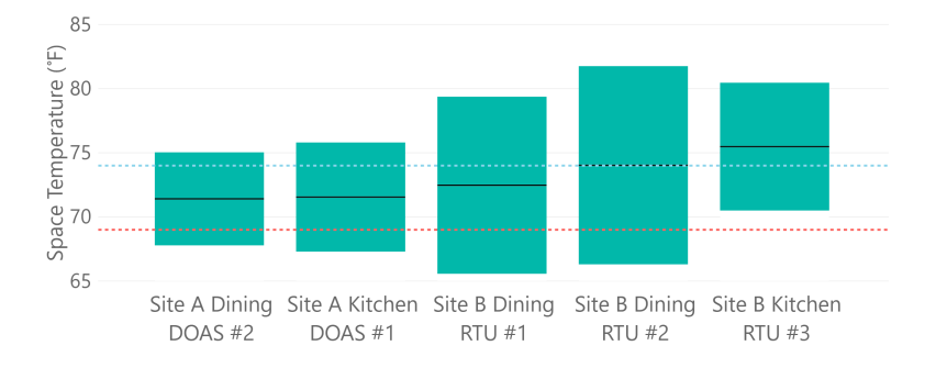
Space Temperature Ranges When Occupied