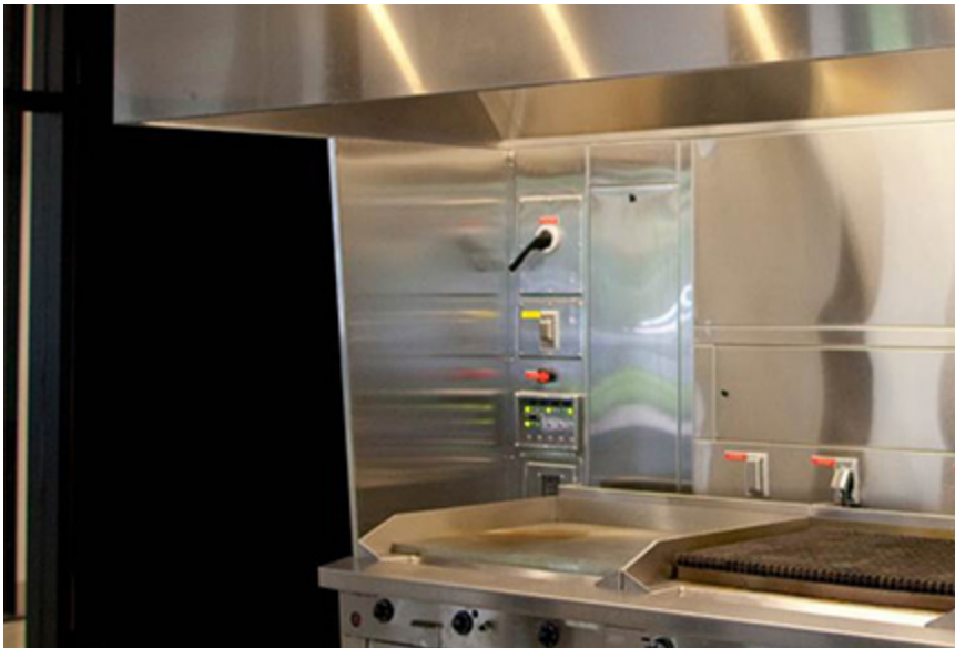
ND-2 Exhaust Hood with Full Vertical End Panel