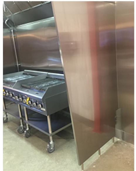
Wide Vertical End Panel (WVEP)